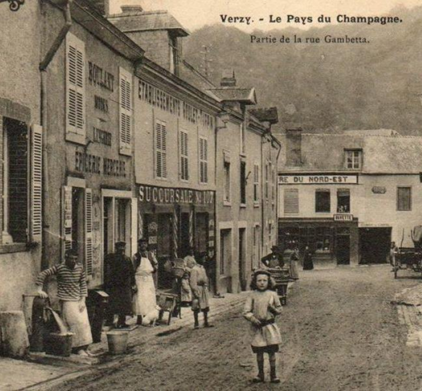
Verzy. - Le Pays du Champagne.